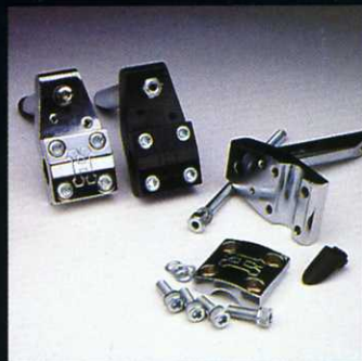
PRO & F/S STEM

PRO STEM & FREESTYLE STEMS have extra reach, and the freestyle version adapts to all rotors without extra brackets.