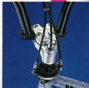
KNEESAVER BARS The handlebar of the pro's, narrow profile, low crossbar, full chromoly. Another Haro original.