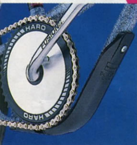
BASHGUARD The first of its kind. Lightweight replaceable alloy sprocket protection.