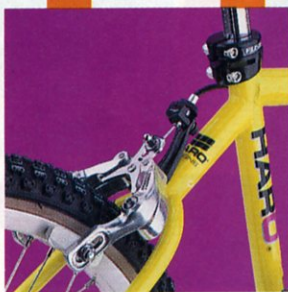
MONOTRAC FRAME Another Haro trademark. Sloping toptubs and rear monostay construction.